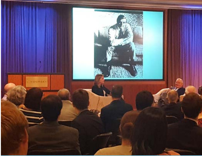
Former Vice President Walter Mondale speaks to Summer Associates.