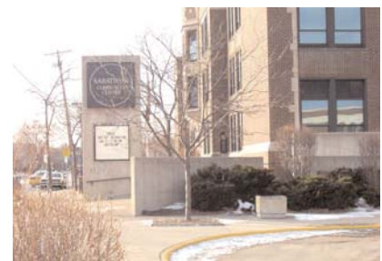
Sabathani Community Center

The legal clinic is being staffed by attorneys in the Tax, Trust & Estate Planning and Employee Benefits Departments. The clinic is open the second and fourth Wednesday of each month. Clients are able to sign up through the Community Center office and meet with our attorneys concerning matters such as consumer, debtor's rights, bankruptcy, housing, landlord/tenant, employment and other civil issues.